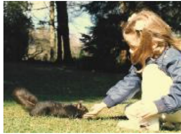
A child with a squirrel as they find a moment of happiness.

Write to: Parks Board Commissioners ( pbcomment@city.vancouver.bc.ca ), Vancouver Mayor and Council ( mayorandcouncil@city.vancouver.bc.ca ) Your Federal/Provincial Politicians