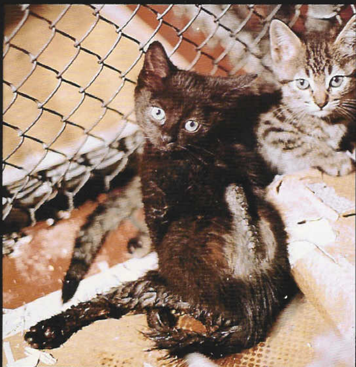
Snap and Pop, also crippled. Crackle, their sister, died from a "probable burst bladder" according to the researchers' records. (Spinal cord injuries usually stop natural urination.)