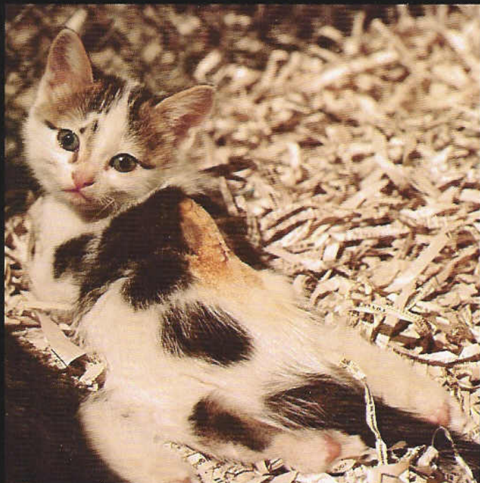
#1054, intentionally crippled.