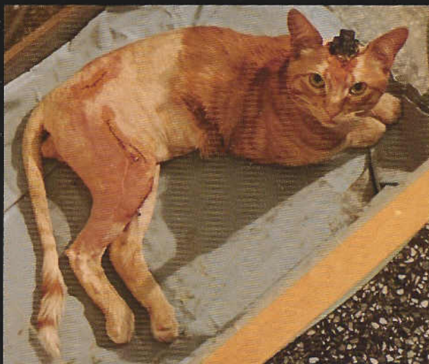
Peaches, with back severed, electrodes in brain, and electrodes and wires embedded under the skin.