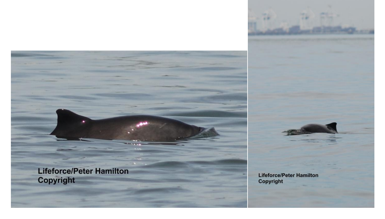
May 16: Friday was one of those days. Js past East Point at approx. 2PM Heading towards Point Roberts. So I told the campers at Lighthouse Marine that Js will pass by. When I went to get needed gas the gas dock was closed because of a gas leak. So 1 hour later I was off. But now the boat alarm went off. Just a false alarm but made me wait near home for them to approach. But by 2000 no sign of them so I gave up. I didn't go back to park because the waiting campers may have had the tar and feathers ready for me.

May 17: On Saturday Js were off SJI and out of the general area for our Lifewatch Boater Awareness Program so it was local education day for boaters at Point Roberts. Boaters had to be advised that they must not drive through the porpoises. Harbour porpoise will avoid boats. They will not ride the wake of boats like the Dall's porpoise and Pacific White-sided dolphins. People can watch them from the beach and if they must go out in their boat then they should shut down and float. When I was photographing them they would pass by with 20 feet of the Lifeforce boat that was floating back and forth with the tides/currents.