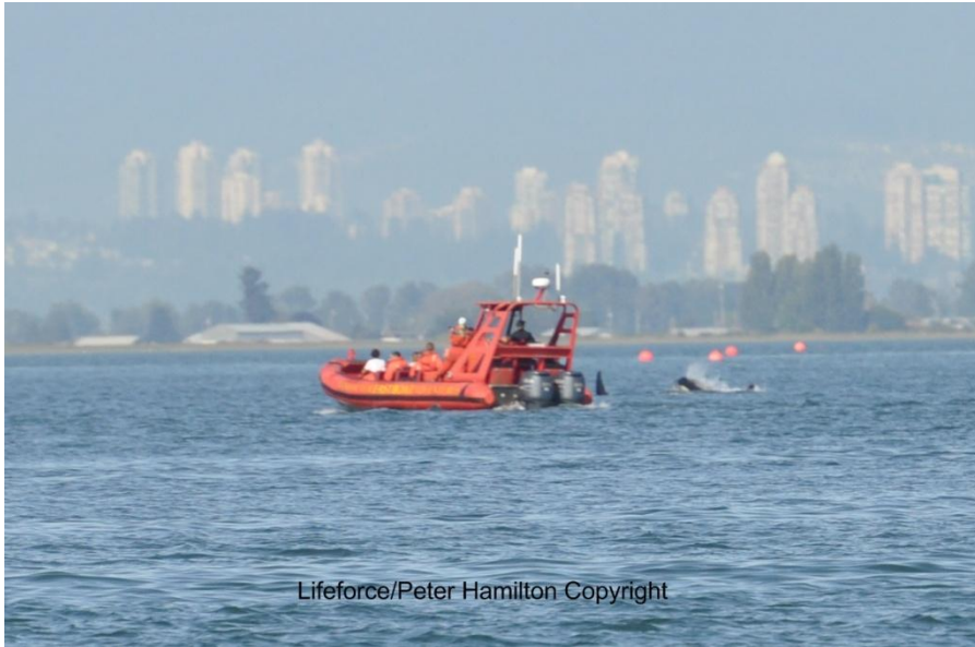
Orca breaches approaching Fraser River.

Aug 27 – Orcas headed out of Active Pass en route to the Fraser River and Point Grey area. In this area there is seldom any government enforcement to protect orcas from whale watch companies and others. There were many violations. One example below is the Vancouver Whale Watch boat motoring well within the 100 meter guideline.