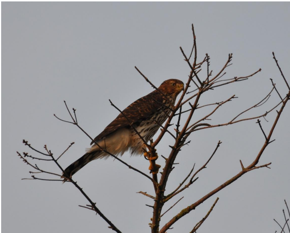
Immature Cooper's Hawk