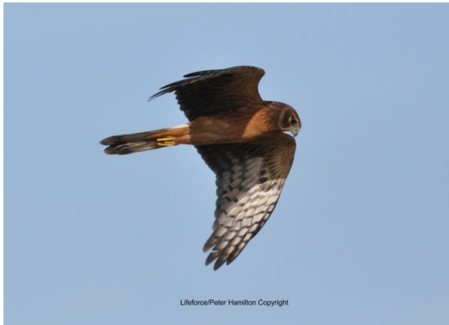
Immature Northern Harrier