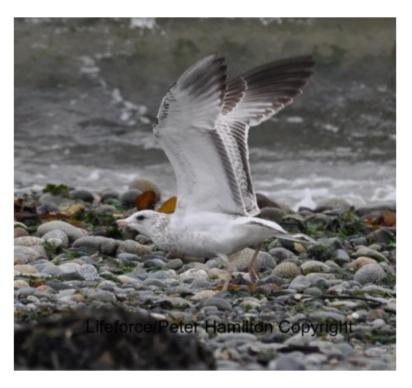
Adult (with feather on bill)