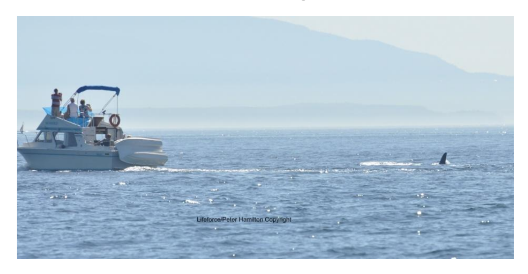
Whale Watch company parked in path way against the legislation (Company is Orca Spirit)