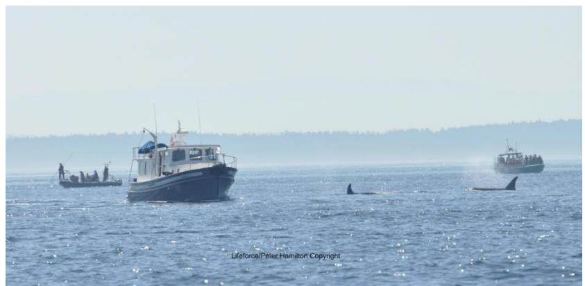
Other pleasure boat Pacific Hi within 100 yards and way too close to orcas