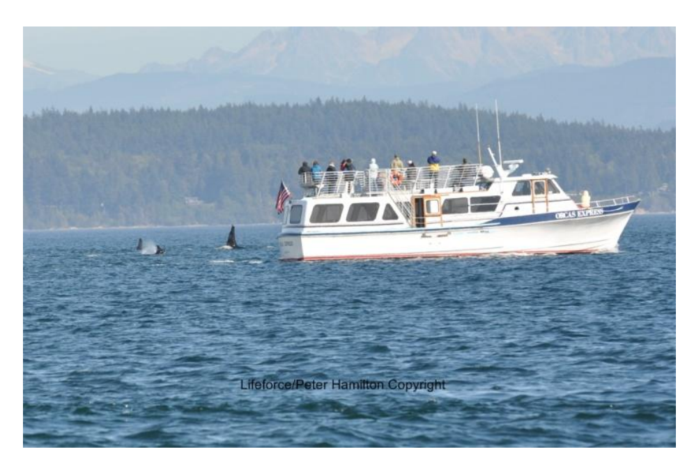
Seaquest - "Keiko" in violation