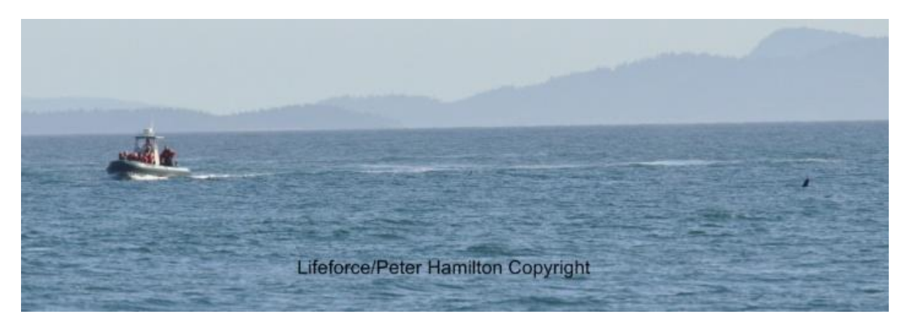
September 25 – First Black-capped chickadees were seen and then it was off to Active Pass. The orcas headed to Point Roberts