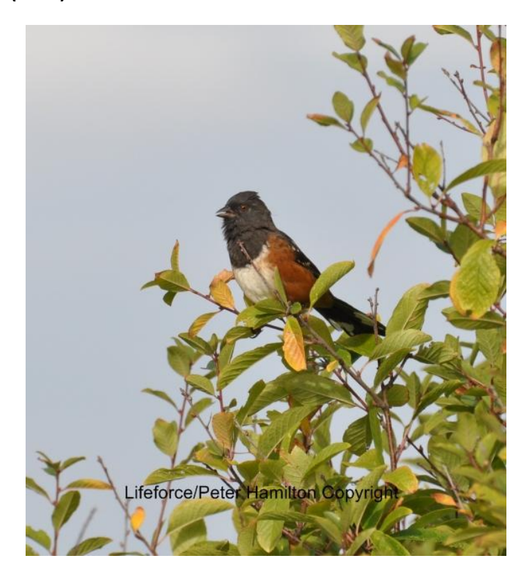
Caspian Tern with fish off park