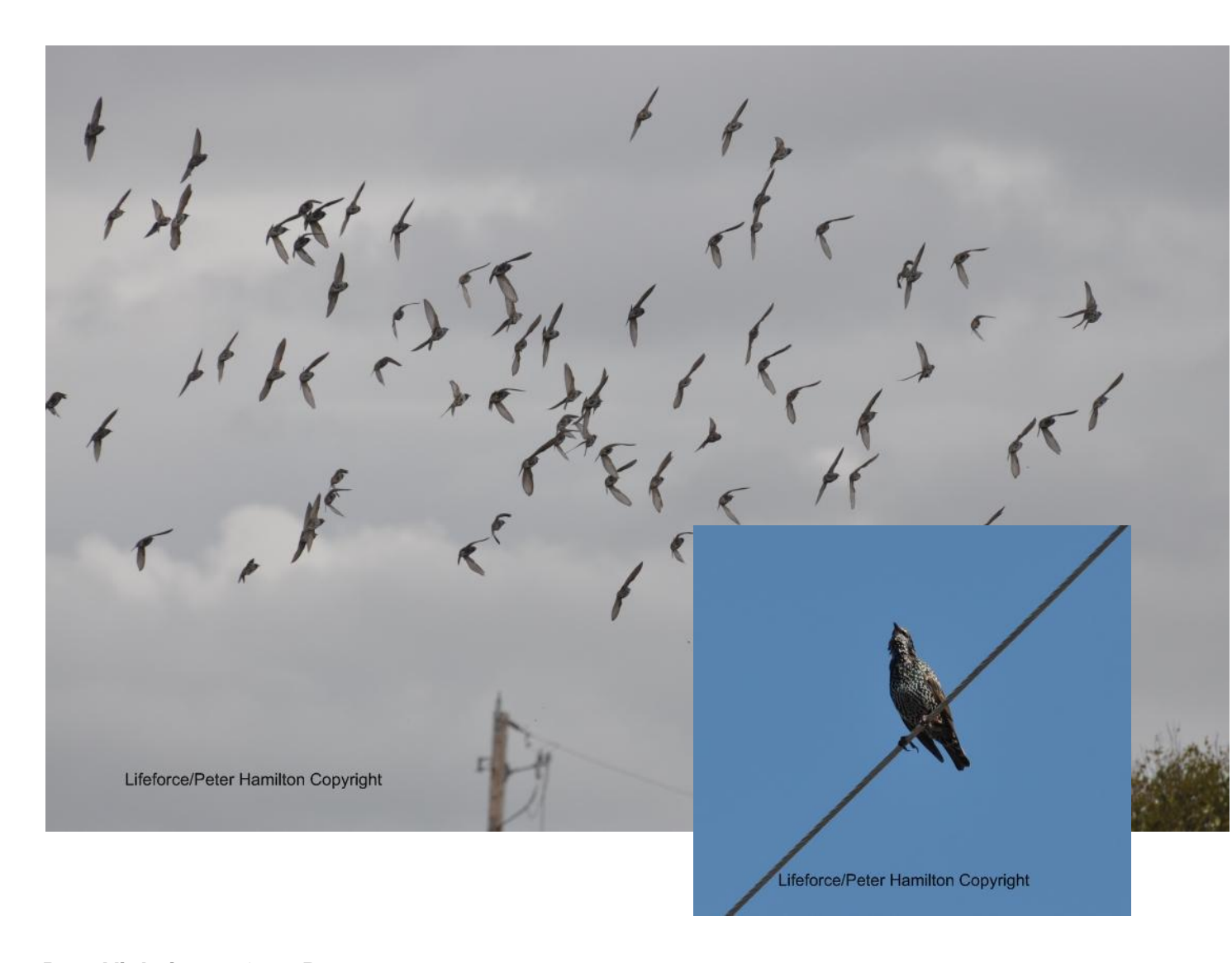
Boat Violations - Orca Report