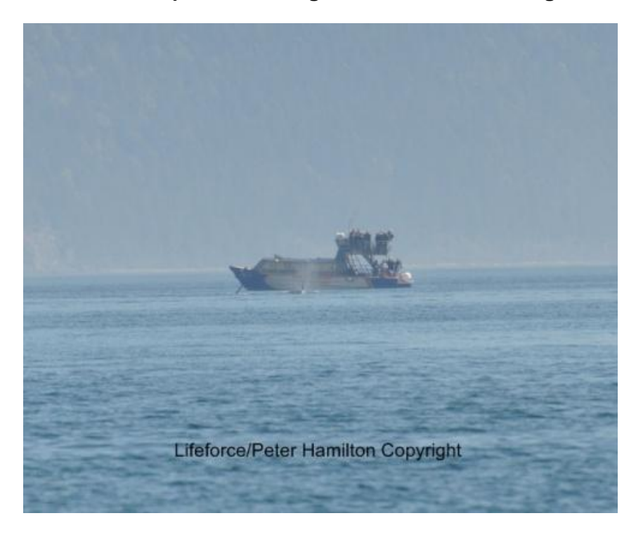
"Emerald Moon" again in violation