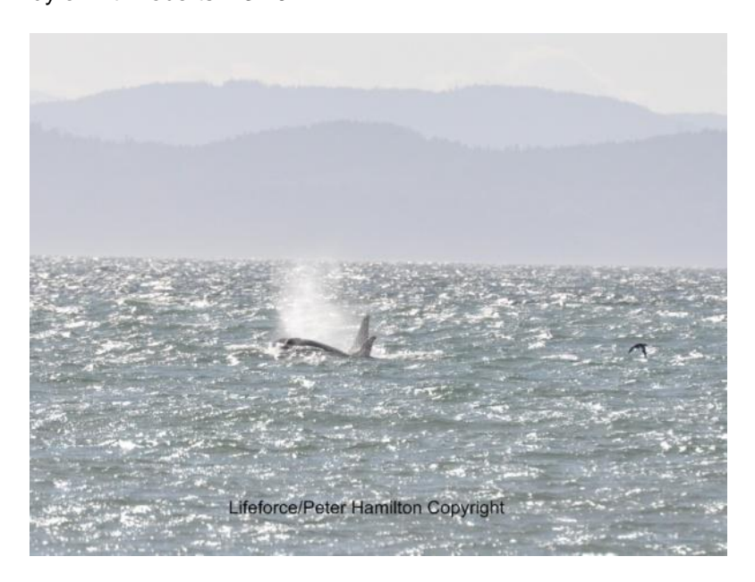
Sepetember 27 – 2 orcas seen off Point as darkness rolled over us

September 26 - Windy off Pt. Roberts - 3:10 PM