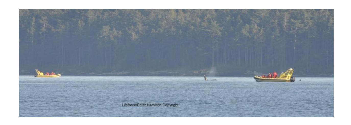
Saturday September 12 An orca does repeated breaches off Lighthouse Marine Park, Pt. Roberts