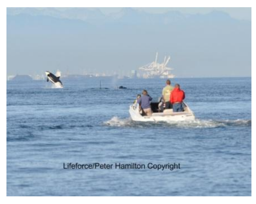
Sea Fun's "Serengiti" – Company fined last year but still not following the regulations!