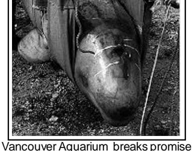
and captures three more belugas. (1990) Canada bans beluga exports.

PNE stops pigs races and animals in vending machines. (1987) In 1988 they stopped baby chimp acts.