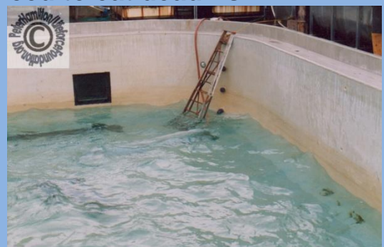
It's A Zoo