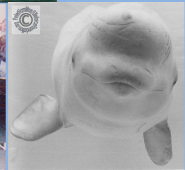
Rope Wounds of beluga who was released. Belugas kept in 3' water and forced to eat dead fish.