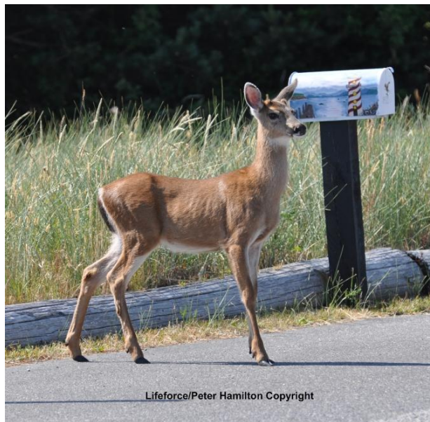
Deer at Lighthouse Marine Park

Later in the day a deer was at the front entrance of the park.