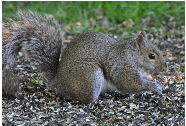
Gray Squirrel.

Lifeforce Wildlife Reports, Nature Moments videos, and Wildpeace photographs are available at www.lifeforcefoundation.org .