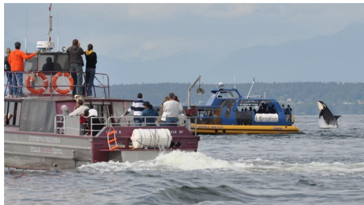
Whale Watch Boats driving too close to orcas (June 2009)

Photographic evidence collected by Lifeforce led to fines against one Victoria-based whale watch company.