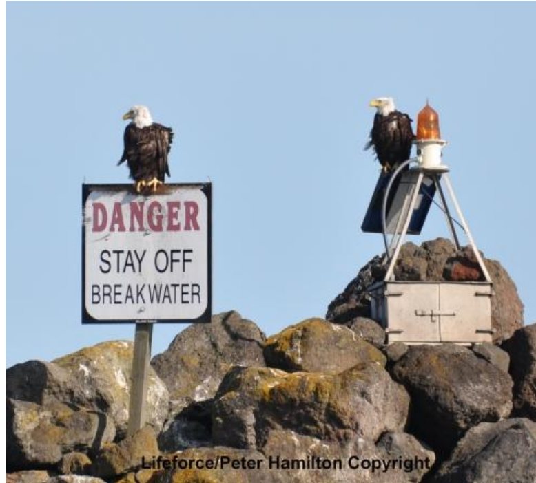
Eagles at Point Roberts Marina

On Monday June 29th at 0625 a few orca orcas passed Point Roberts heading Southeast. They were difficult to identify due to frigid strong winds whipping up 4 foot waves. They were just travelling through with scarce surfacings then long dives. We usually see individual orcas doing several surfacings as they approach and round the park point. It is possible that these were the trailers since I'm quite sure that there was a breach and some blows off in the distant rough waters earlier this morning. Sometimes groups will travel pass with a separation time of over one hour.