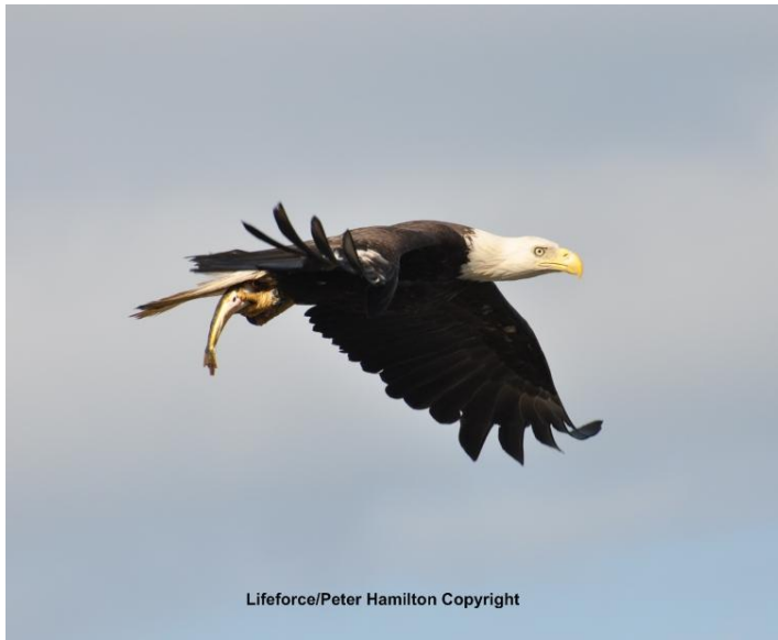
Eagle with bullhead in talons

Later in the day a deer was at the front entrance of the park.