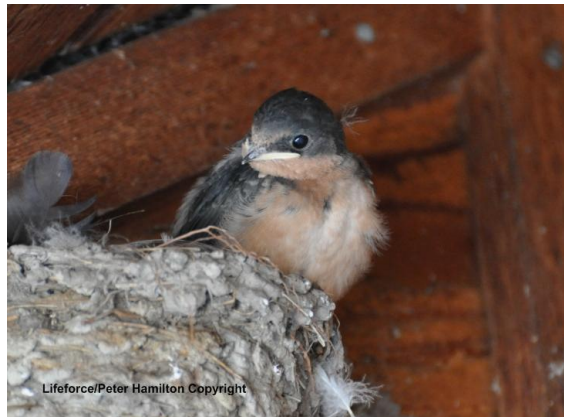
Contemplating that first flight

Two Barn swallows took their first flight around the park in Point Roberts. One waited a bit nut eventually wanted to fly like the others.