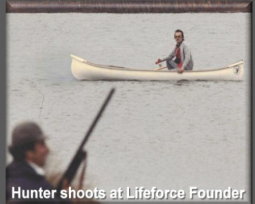
Hunter shoots at Lifeforce Founder