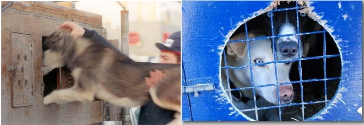
Ft. Nelson, BC, Canada: Can carry a load of 50 - 56 dogs

The dogs are crammed into small spaces. Airlines have very strict rules governing the transport of animals on any flight, even short ones. Look at Continental Airlines' guidelines: http://www.continental.com/web/en-US/content/travel/animals/kennel.aspx . For example, they require that dogs be able to sit up, lie down and move freely. I don't think the dogs can do these things in those dog crates/trucks.