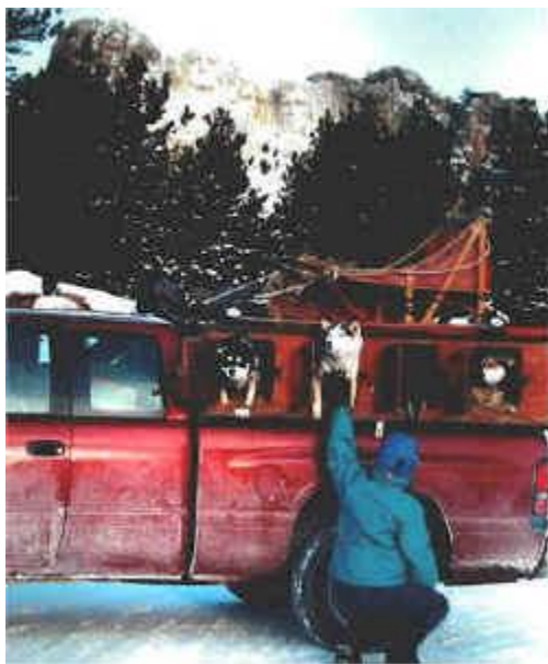
Ft. St. James, British Columbia has round pens that could make standing very difficult.