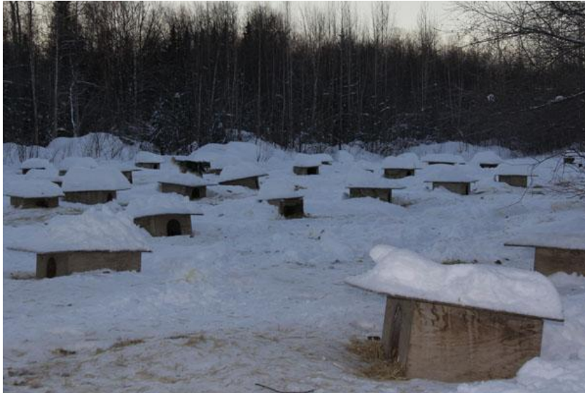
The plot of land near milepost 92 where the dogs were bred