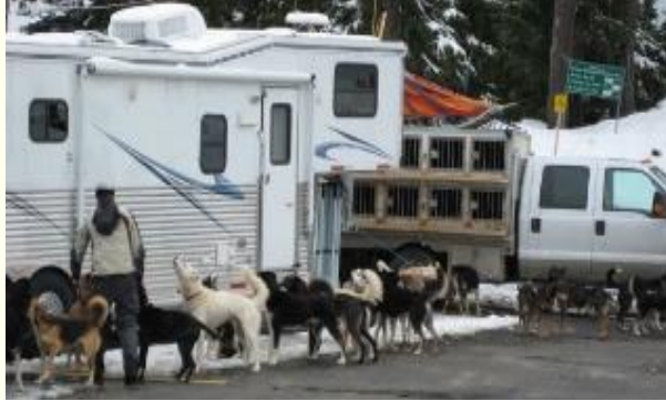
Seymour Mountain, North Vancouver, BC parking lot.

The man who admitted that he killed the sled dogs says he asked the SPCA to help. The BCSPCA denied that they were asked to take the dogs prior to the killings.