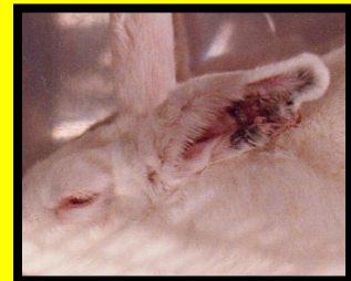
Rabbit subjected to repeated blood tests.