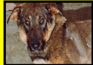
The vocal cords of this dog were burnt.