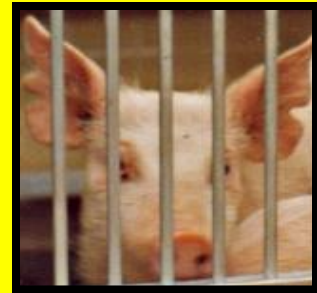
Pig with ear notches.