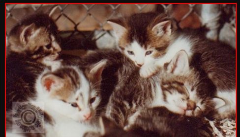
This kitten who is starting to walk will soon be paralysed

The spinal cords of kittens are injured and the paralysed kittens and cats are forced to try to walk on a treadmill. Wires run under the skin to a head plug for recordings. Researchers bend and squeeze the tails. These experiments have been repeated for over thirty years while rehabilitation for humans has also been used for decades.