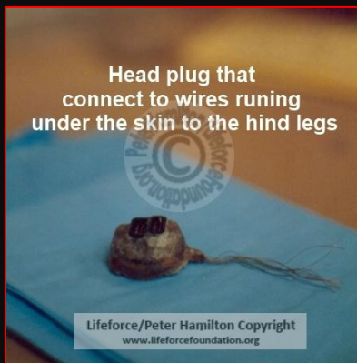
Head plug that connects to wires running under the skin to the hind legs