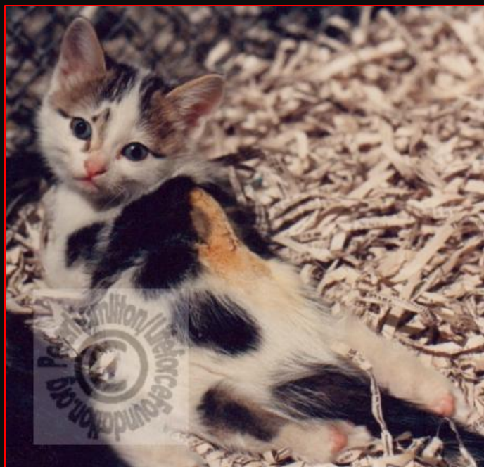
#1054 who was intentionally crippled.