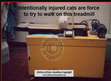
Intentionally injured cats are forced to try to walk on this treadmill