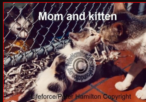
Mom and kitten