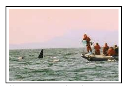
Numerous research projects causes more boat traffic stress.

Instead of providing funds for immediate, practical solutions (such as boat traffic monitoring/education, land-based "Orca Trails" whale watching and oil spill preven-